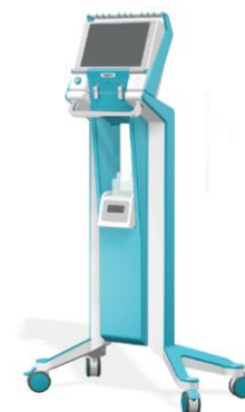
Artificial lung ventilation device AIVL-01