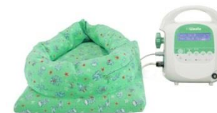
Heater for neonates ODN-01