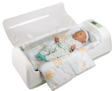
Portable neonatal incubator BONNY