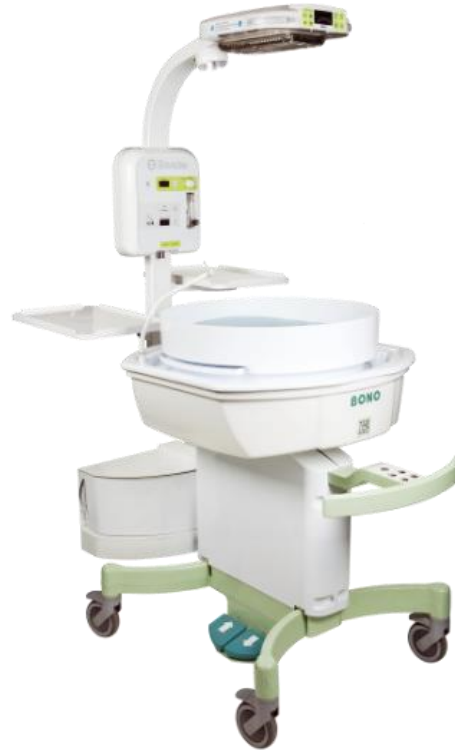
Open resuscitation system ORS-BONO