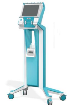
Artificial lung ventilation device AIVL-01