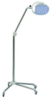
Phototherapy irradiator OFN-02