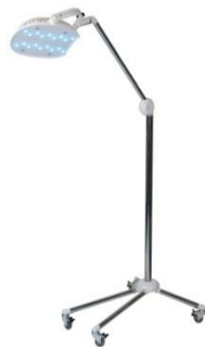
Phototherapy irradiator OFN-03