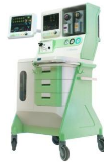
Multifunctional device of inhalation anesthesia MAIA-01