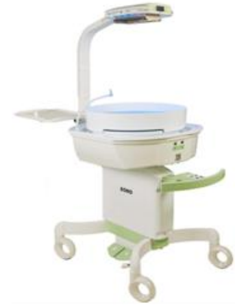
Neonatal table SNO-BONO