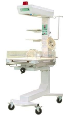
Neonatal table SNO