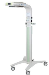
Neonatal heater "Radiant heat"-BONO, launched in 2017